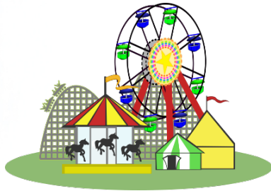
Trip to County Fair